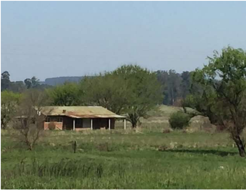
TYPICALLY, SOUTH AFRICAN!